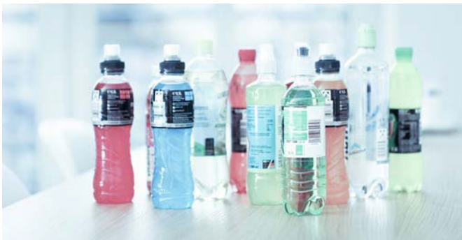
Fig.1 Isotonic beverages

of 150 \mu L. The diagram in Fig 2 shows the average values of osmolality for the isotonic samples together with the EFSA limits. The non-isotonic beverages have a much higher osmolality. For samples of caffeine containing soft drink and beer osmolalities of 644 mOsmol/kg and 1008 mOsmol/kg, respectively, were determined. As alcohol is also depressing the freezing point, the osmolality.